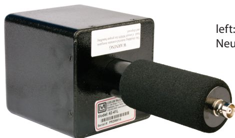
left: Model 42-41L Neutron Detector